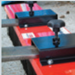
Quick-Tite fork pockets Simply attach to most forklift tines