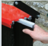
Easy brush replacement Features long lasting polypropylene fixed brush sections