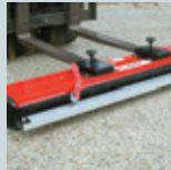
Optional magnetic bar Assures removal of nails and metallic debris