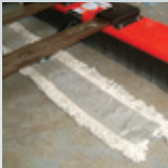
Optional dust mop Ideal for sweeping fine materials on polished floors