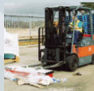
Warehouse and distribution sites